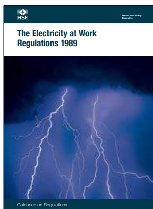
HSR25 (Third edition) Published 2015

This new edition of HSR25 will help dutyholders meet the requirements of the Electricity at Work Regulations 1989. It will be of interest and practical help to all dutyholders, particularly engineers (including those involved in the design, construction, operation or maintenance of electrical systems), technicians and their managers.